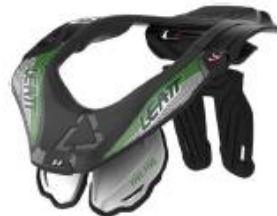
Neck Brace 5.5 #Junior

NOTE: the Technical File contains a more detailed description of the PPE (material, method of assembly, photographs or drawings), performance data, safety functions and level of protection, elements of conformity to the basic and supplementary requirements. The Technical File is integral part of the present Certification, which has to be kept available by the applicant to be forwarded - upon request - to the entitled person (supervising body, Controlling Officer).