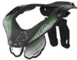
Neck Brace 5.5 Blk