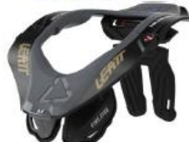
Neck Brace 5.5 Stealth