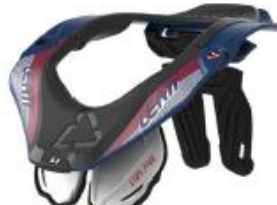
Neck Brace 5.5 Royal