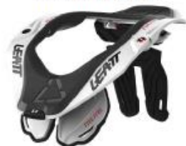
Neck Brace 5.5 Wht