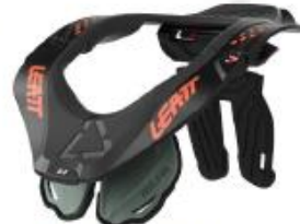
Neck Brace 5.5 Cactus