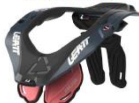
Neck Brace 5.5 Coral